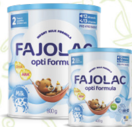
Infant milk formula "FAJOLAC Opti Formula" for babies from 6 to 12 months (further nutrition) with nucleotides, prebiotics and probiotics (bifidobacteria). 800 g / 400 g