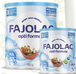
Infant milk formula "FAJOLAC Opti Formula" for babies from 12 months (complementary foods) with prebiotics and probiotics (bifidobacteria). 800 g / 400 g