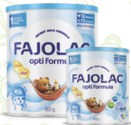
Infant milk formula "FAJOLAC Opti Formula" for babies from birth to 6 months (primary) with nucleotides, prebiotics and probiotics (bifidobacteria). 800 g / 400 g

The combination of the optimal amount of prebiotics and probiotics in infant milk formula "FAJOLAC Opti Formula" ensures the formation and maturation of the proper functioning of the baby's gastrointestinal tract during the first year of life and supports it in the future.